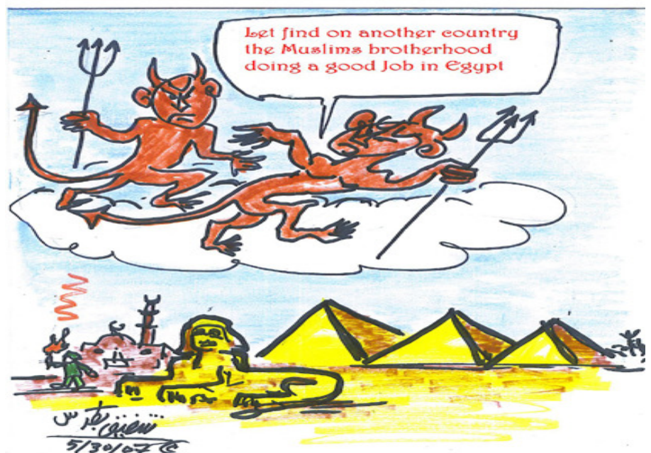
All the Muslims savage attacks against Christians in Egypt happen after Muslims Friday's prayers Friday's Prayers spread hatred messages in Egypt

Then came al-Qaeda led by bin Laden. For the first time, an international jihadi organization was making a major effort to operate in many different countries, Muslim and non-Muslim. Still, the ideology of al-Qaeda is from the Egyptian Ayman al-Zawahiri, one of the leaders of the Egyptian jihadi group. He and a number of his colleagues fled from the authorities after the assassination of President Sadat and went to Afghanistan.