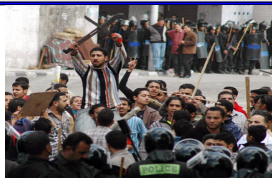
2- Security interference too late

Tension prevails between Christians and Muslims in the villages of Bemha of Al-Ayat in Giza governorate, because due to the spread of Islamic terrorism armed gangs with knives, swords, buckets filled with oil and sticks. The collusion of the security with Muslims against Christians increases tension and persecution of Christians and abuse by the gangs of Muslims and Muslim extremists.