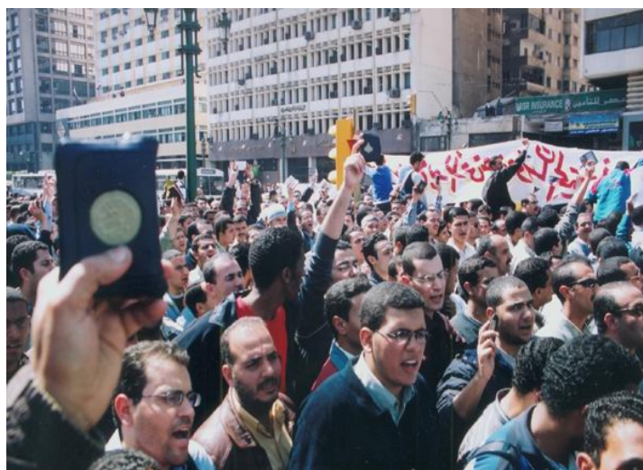
The Muslim Brotherhood, some holding the Qur'an, demonstrate in downtown Cairo

Copts did not despise or curse Egypt and did not ask for Khalifa from Malaysia to come to govern Egypt as the Muslim Brothers General Guide, Mahdi Akef once said. Any group of people would like to participate in the “Political Process” under “the Modern Civil State” must abide by the rules, number one rule is to renounce violence. Muslim Brothers by adopting “Jihad” in their manifesto, have automatically excluded themselves from the “Political Process”