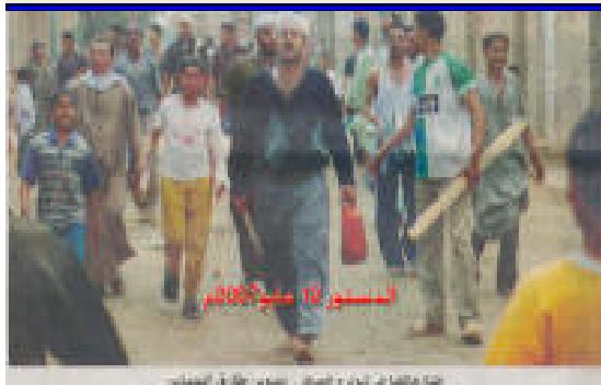
1- Muslims attack Christians