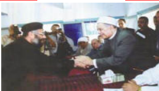
3- Meeting for Reconciliation

Copts have agreed with the Muslims in the village for expansion of a nearby church used as hosts and receive mourners and the establishment of the weddings, but they were surprised by distributing leaflets inciting demonstrations and crowd and the attack on the village on all Copts, which, numbering about 350